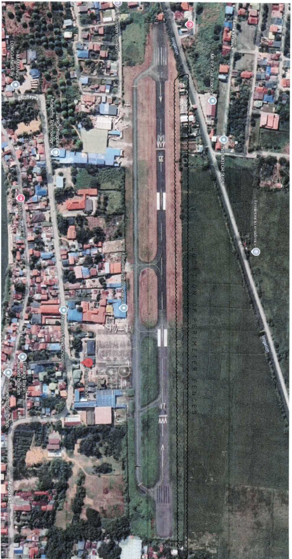
A-1 LOCATION MAP SCALE N. T. S.