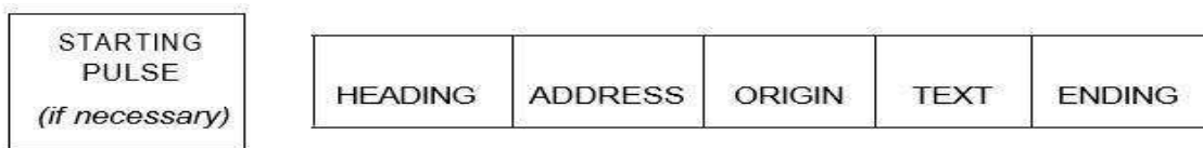
Figure 2.4-2. Form of transmission – teletypewriter operation (see 2.4.4.10.1.2)