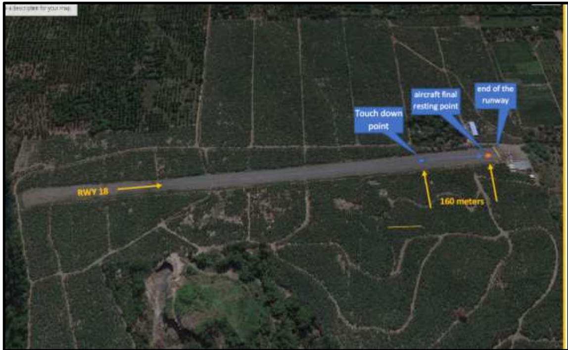
Figure 3: Approximate aircraft track

A pilot landing in a tailwheel aircraft is challenging in any wind condition. When there is a tailwind, landing safely is even more difficult. In this event, RP-R 4861 was making a landing with approximately 12 to 15 knots tailwind. It touched down hard almost at 1/4 th of the remaining runway. It bounced twice, followed by the propeller ground strike after a nose over due to hard braking. As with any landing, maintaining aircraft control is the first priority, but in this case, the tailwind increases the aircraft's ground speed, and there is the problem of stopping the aircraft safely. A go-around should have been initiated during un-stabilized approach.