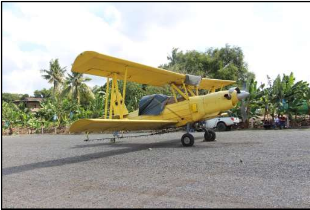
Figure 1. Aircraft's final resting point