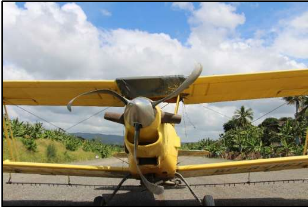
Figure 2: Propeller blades bent at mid span

The aircraft came to a complete stop with a heading of 180 degrees and coordinates of 07°13.49" N, 125°27.43" E. All of the three (3) propeller blades were bent at midspan.