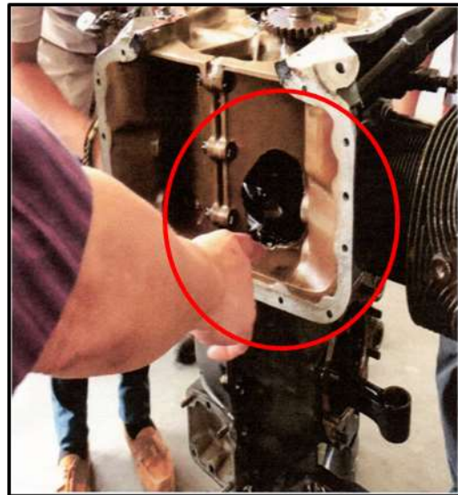
Figure 7. The hole in the crankcase.