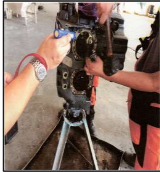
Figure 5. Broken connecting rod Cylinder #3.