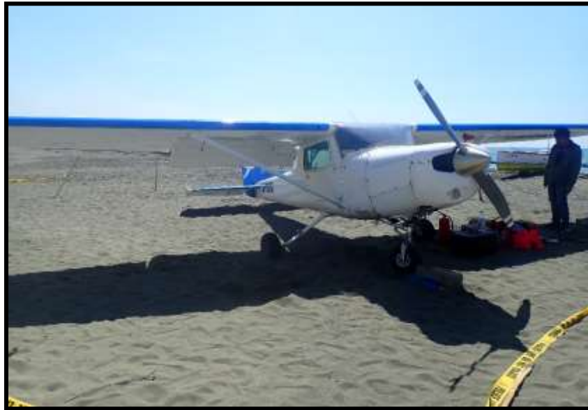
Figure 1. RP-C1030 at its final resting point.