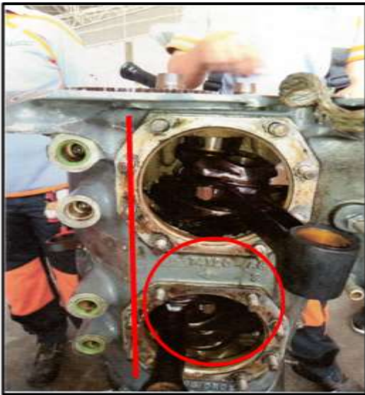
Figure 4. Broken crankshaft.