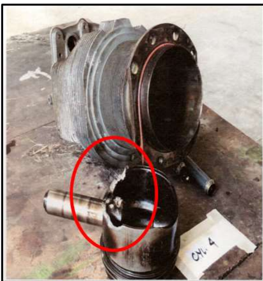
Figure 2. Cylinder #4.

The engine teardown highlights the damage to cylinder #4's piston (Figure 2). The cylinder #3 was also damaged and its connecting rod big end cap bolt was broken (Figure 3). Additionally, the crankshaft was broken too (Figure 4). The connecting rod of cylinder #3 impacted the crankcase resulting to a hole above the oil sump. The misalignment between the cylinder and its rod resulted to the connecting rod becoming stuck in place (Figure 5). Assorted debris of engine materials were collected on the oil sump (Figure 6). The hole was measured roughly about seven point seventy-eight (7.78) centimeters (Figure 7). Hence result of the engine teardown on which the crankshaft was broken substantiated that the engine could not perform normal operation.